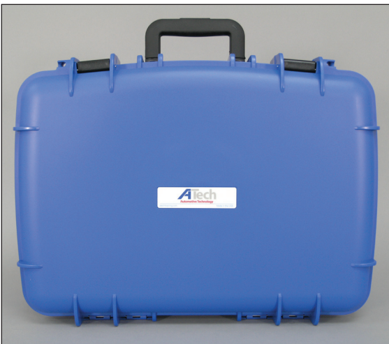
Optional Storage Case available.

Technical Education Products, Inc. 87 South Road • Hampden, MA 01036 Toll Free: 800-487-6825 Phone: 603-595-9730 • Fax: 775-587-5334 E-mail: info@techedproducts.com www.techedproducts.com